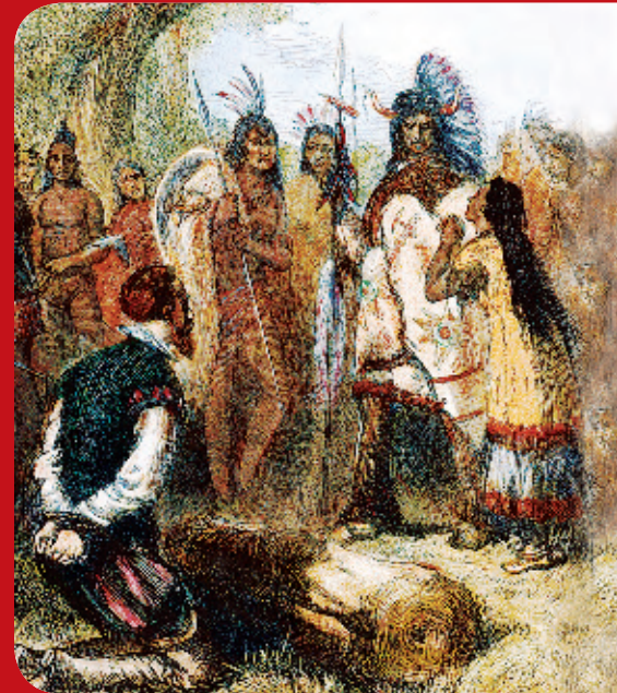
Pocahontas rescues John Smith.