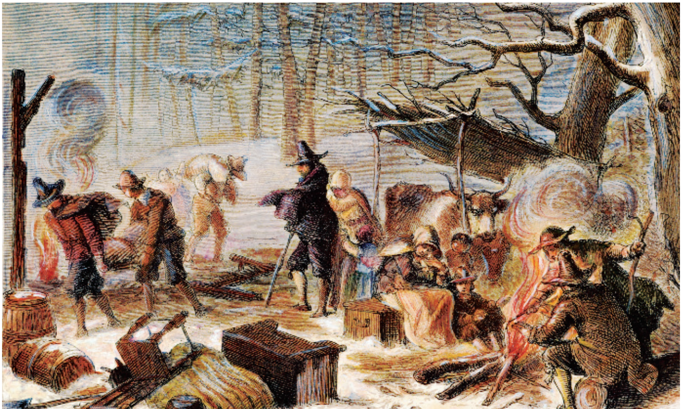
The First Winter of the Pilgrims in Massachusetts, 1620 (1800s). Colored engraving.